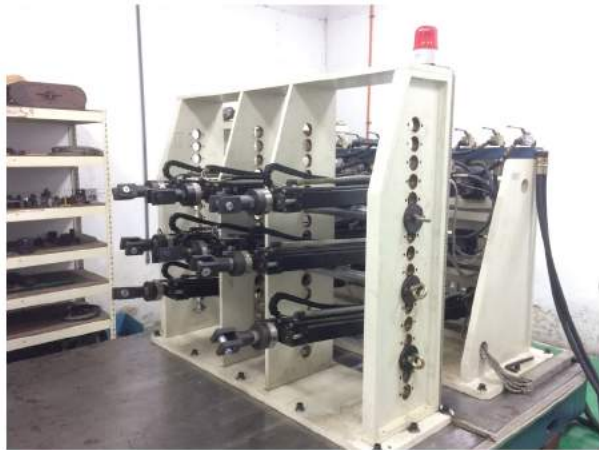
SEAT ANCHORAGE MACHINE