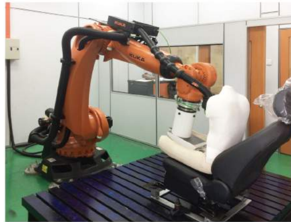
INGRESS EGRESS MACHINE

At APM, our seats are tenaciously tested to well over 70 forms of international automotive quality and safety standards requirements. As an OEM components manufacturer, APM have its own product test center with facilities to test its products to all known quality and safety requirements.